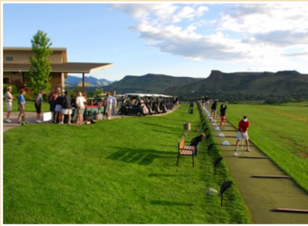
Fossil Trace Driving Range