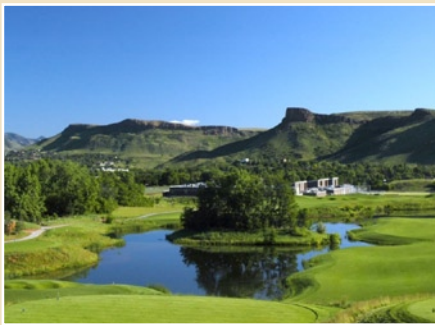
Views on the Fossil Trace course