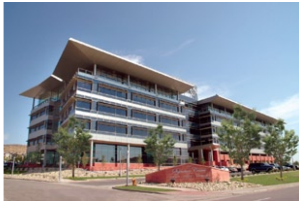
Signature Centre, 2007

Date: Tuesday, September 11, 2007 Time: 4:00 – 5:00 pm Location: Signature Centre 14143 Denver West Parkway Golden, CO 80401 Cost: Members - $10 Non-Members - $20 Registration: Go to the Denver Chapter of IFMA web-site, www.ifmadenver.org click on Events and register MUST PAY AT REGISTRATION Program: Tour of Signature Centre, a Platinum LEED project Refreshments at conclusion of tour