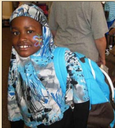
New backpack matches my scarf