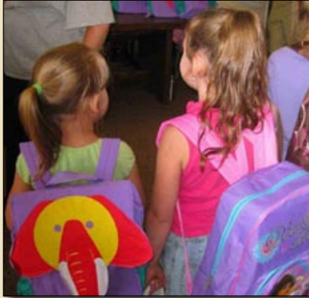
Elephant and Princess backpacks