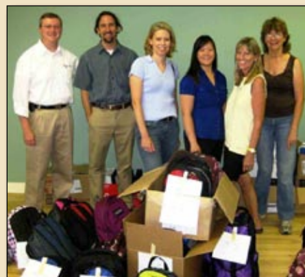
Lots of backpacks and supplies

gram, the Chapter will be offering the Business of FM and the Operations and Maintenance course to help some of our members complete the current program. We are currently working on scheduling. We hope to have it posted for registration soon.