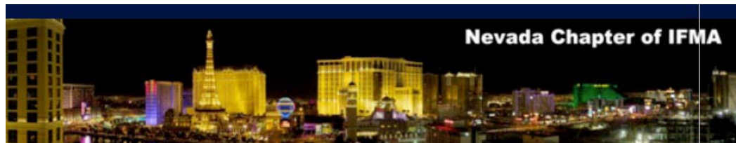
Nevada Chapter of IFMA