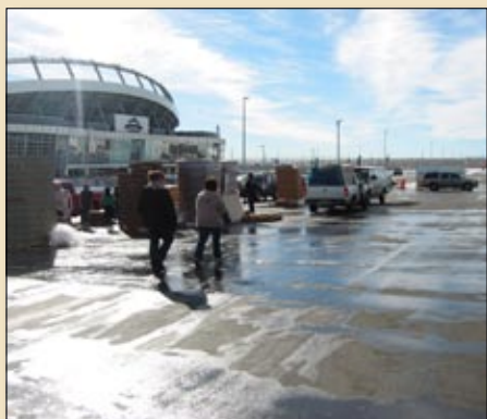
Invesco Field at Mile High – one of the locations for distribution of Girl Scouts of Colorado cookies.

training when you join us in Boston, MA, March 23rd to 25th.